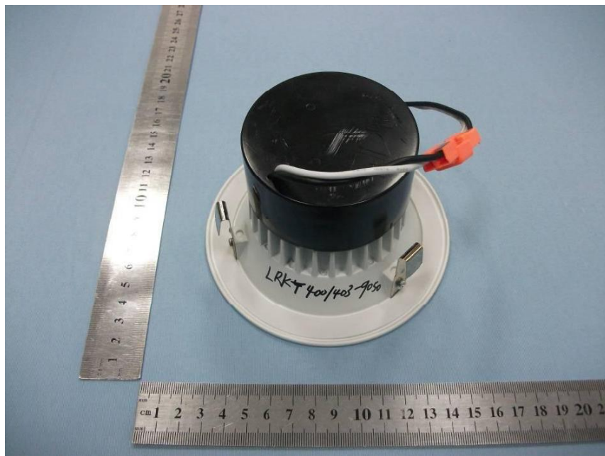
Picture 2 Back View